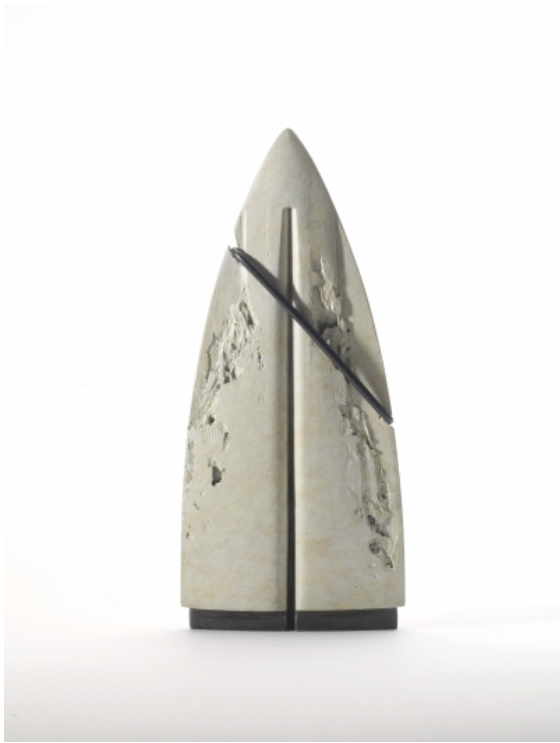
Light Shadow , 2012 Bronze and neoprene 7.9 x 3.5 x .9 in.