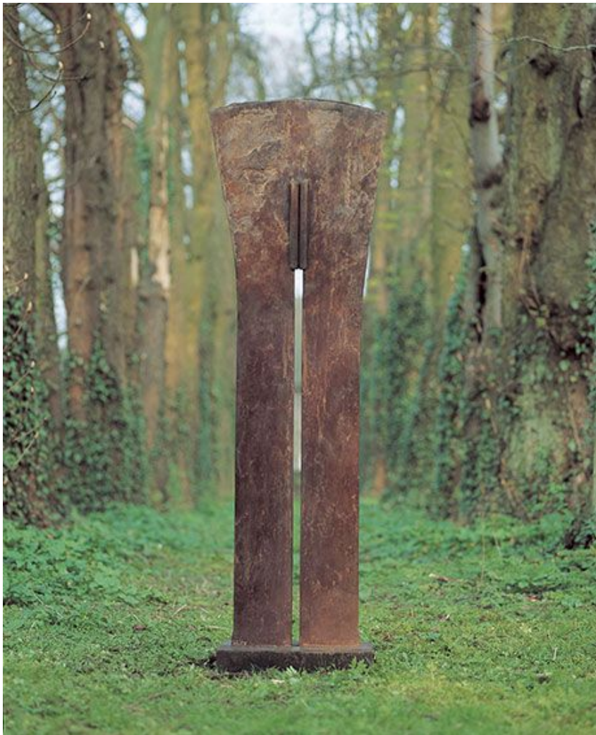
Line of Silence , 1991

Highlights of works to be shown in the upcoming exhibition are as follows: