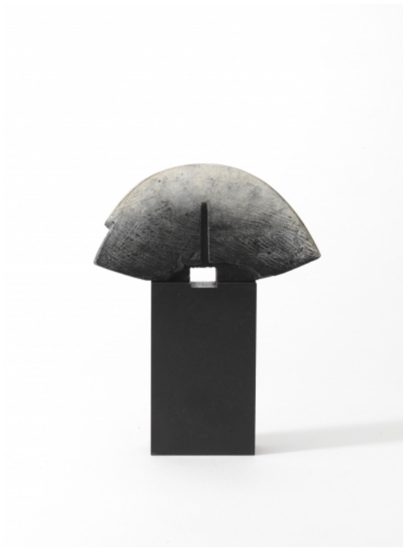
Found Line- 2, 2013