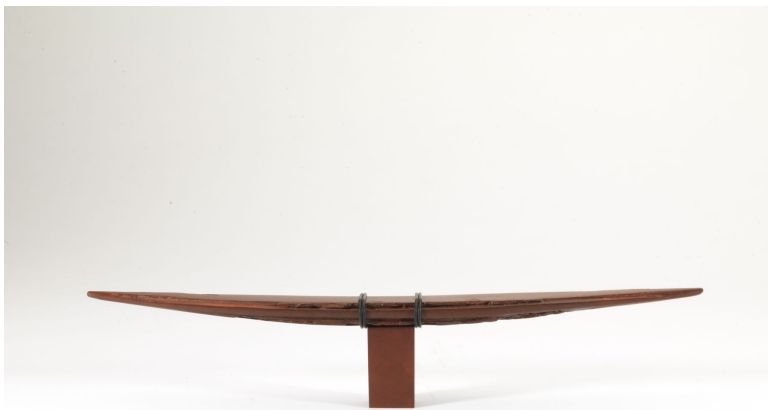
Resting Line, 2013