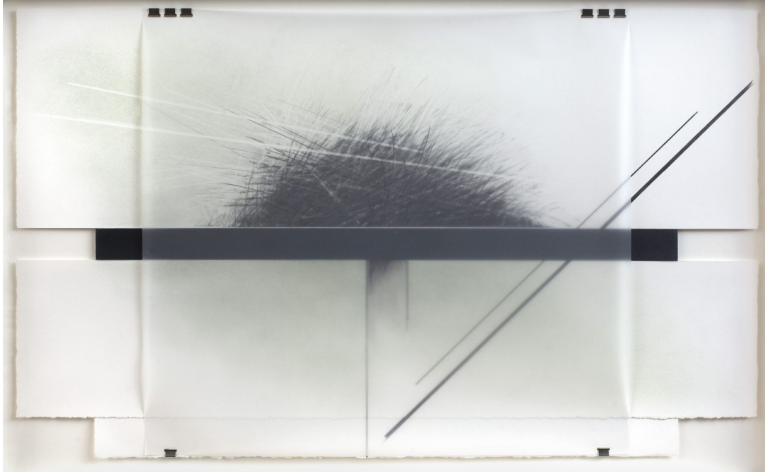
Following Lines 1, 2016 Mixed media 25.4 x 40 in.