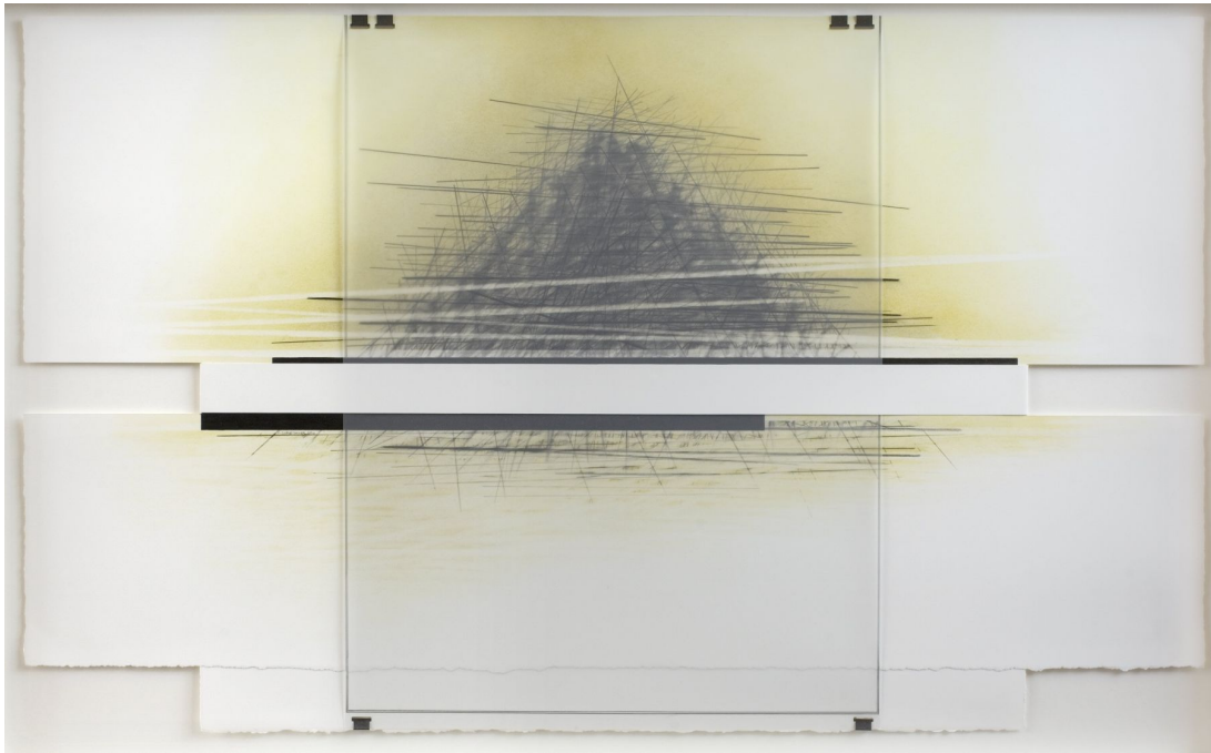
Following Lines 2, 2016 Mixed media 25.4 x 40 in.