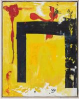
Jeffrey Wasserman The Boulevard , 1991 Oil on canvas 18h x 14w in