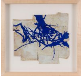
Maysey Craddock The Shadow of Lost Trees , 2013 Gouache and silk thread on found paper 11.75 x 12.25 in. 29.84 x 31.11 cm