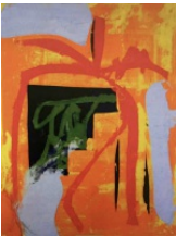
Jeffrey Wasserman The Terrace , 1993 Oil on canvas 16h x 12w in