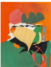
Beatrice Mandelman Untitled , c. 1960s Acrylic and collage on paper 25.50h x 19.63w in