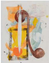
Jeffrey Wasserman Untitled , c. 1980 Oil on paper 24.5 x 19.5 in. 62.23 x 49.53 cm