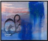
Jeffrey Wasserman The Garden Gate , 1987 Oil on canvas 30h x 36w in