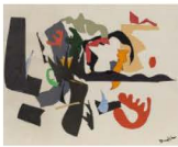
Beatrice Mandelman Untitled , c. 1960s Collage on canvas paper 16h x 19.88w in