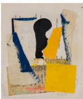
Morris Barazani Untitled (Derek Timmerman) , 1970s Collage on paper 12.4 x 10.5 in. 31.4 x 26.7 cm