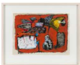
Beatrice Mandelman Untitled (Eye to Eye) , c. 1960s Mixed media and collage on paper 12.50h x 17w in