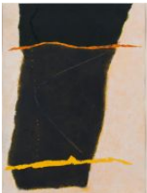
Theodoros Stamos Infinity Field, Lefkada Series #II , 1970 Acrylic on paper 30.5 x 22.25 in. 77.47 x 56.52 cm