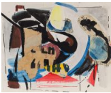
Beatrice Mandelman Untitled , c. 1960s Collage and acrylic on paper 9.25h x 11.13w in