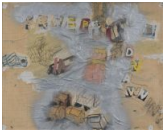
Larry Rivers Perspective drawings , 1965 Paper collage, graphite, and enamel spray on paper mounted on panel 17 x 21 in. 43.2 x 53.3 cm