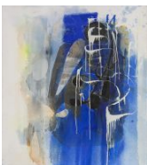
Jeffrey Wasserman Futile Ambassador , 1989 Oil on canvas 60 x 54 in. 152.4 x 137.2 cm