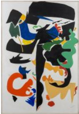
Beatrice Mandelman Sea Shapes (#2) , c. 1960s Oil on Masonite 72h x 48w in