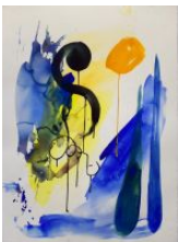
Jeffrey Wasserman Untitled , 1988 Watercolor on paper 30 x 22 in. 76.2 x 55.88 cm