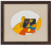
Beatrice Mandelman Untitled , c. 1960s Acrylic and collage on cardboard 10h x 8w in