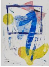
Jeffrey Wasserman Untitled , c. 1985 Oil on paper 30h x 22.25w in