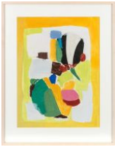
Beatrice Mandelman Untitled , c. 1958 Gouache and collage on paper 25.50h x 19w in