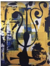
Jeffrey Wasserman Untitled , 1991 Oil on canvas 16h x 12w in