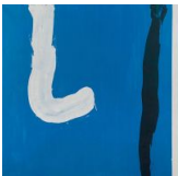
Morris Barazani Untitled (Blue) , c. 1963 Oil on canvas 50h x 50w in