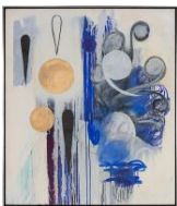
Jeffrey Wasserman The Garden Gate: A Man's Estate , 1987 Oil on canvas 51h x 58w in