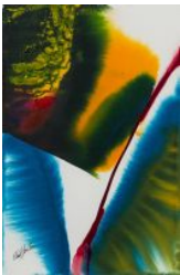
Paul Jenkins Phenomena Right Beckons , 2008 Watercolor on paper 22 x 15 in. 55.88 x 38.1 cm