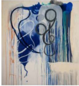
Jeffrey Wasserman B & F Are Old Friends , 1988 Oil on canvas 72h x 66.50w in