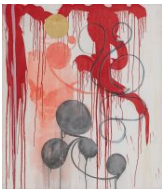
Jeffrey Wasserman The New Dawn , 1988 Oil on canvas 58h x 50w in