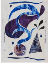
Jeffrey Wasserman Untitled , c. 1985 Oil on paper 30h x 22w in