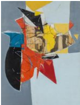
Beatrice Mandelman Untitled , c. 1960s Collage on cardboard 23.88h x 17.88w in