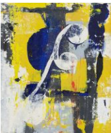
Jeffrey Wasserman Night Life , 1992 Oil on canvas 24h x 20w in