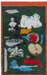
Beatrice Mandelman Untitled (Freaks) , c. 1960s Mixed media and collage on paper 19.44h x 12.19w in